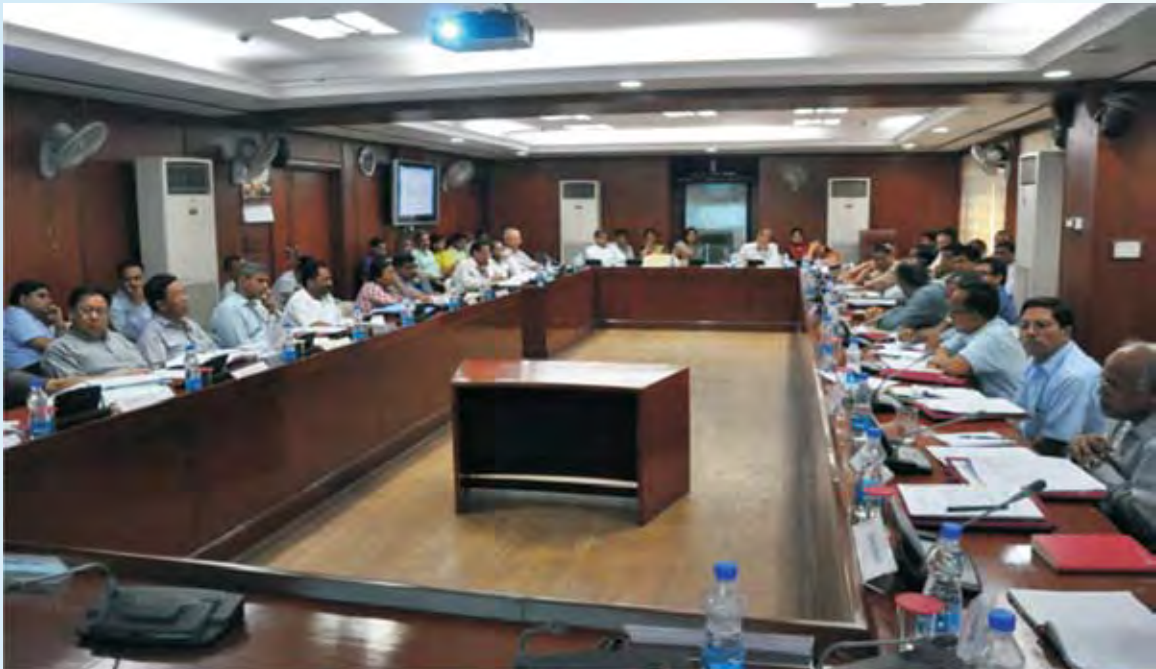
National Consultation on "Assessment of Research and Training Needs in North Eastern Region"