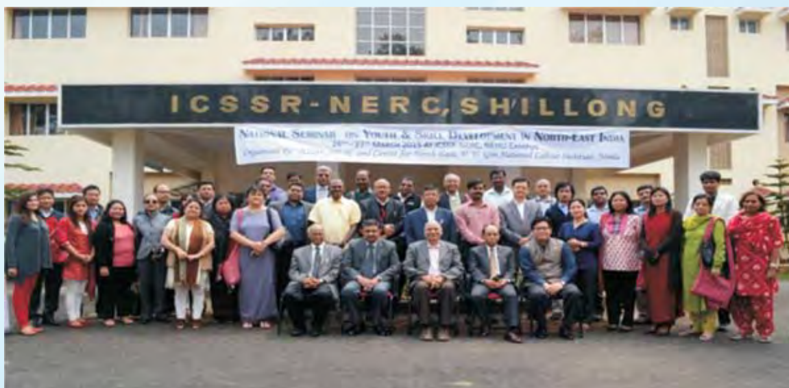
National Seminar on Youth & Skill Development in North East India