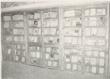
Picture of Reference Library

The "Mandal" is continuously making research and survey relating to Industrial Relations. It holds joint Seminars of the Representatives of Workers, Management and the Government. It conducts