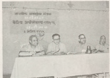
Seminar on 1995-96 Central Annual Budget

The central and state Governments "Annual Budgets, to a large extent influence the economic, industrial and social life of this country. The "Mandal arranges seminars for pre-budget and post-budget critical appraisal of economic conditions and Budget provisions for the benefit of the social workers especially those connected with labour organizations.